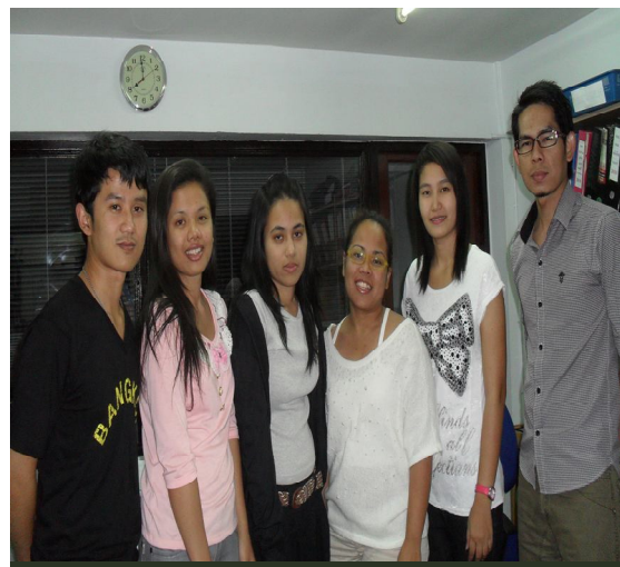
Preaw with the Accounting Team